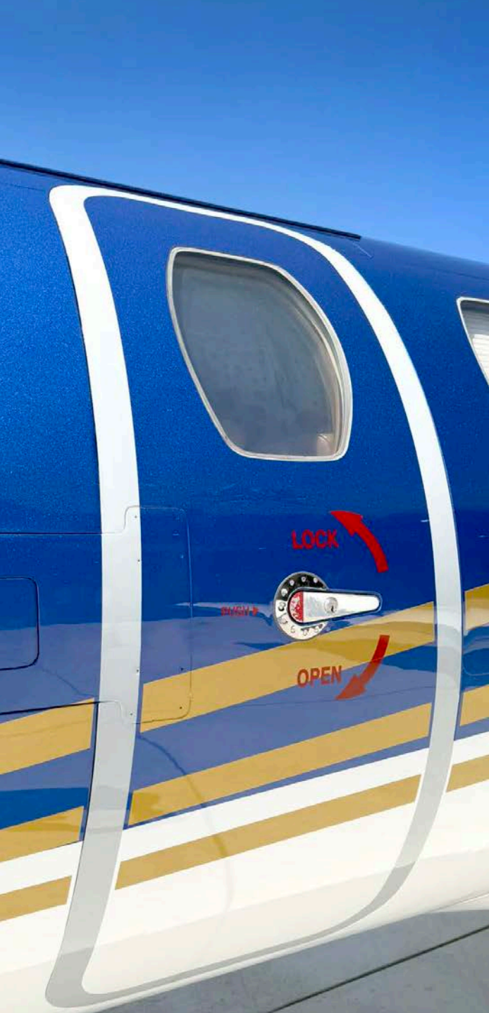
• 2002 Citation CJ2 • 525A-0120 •