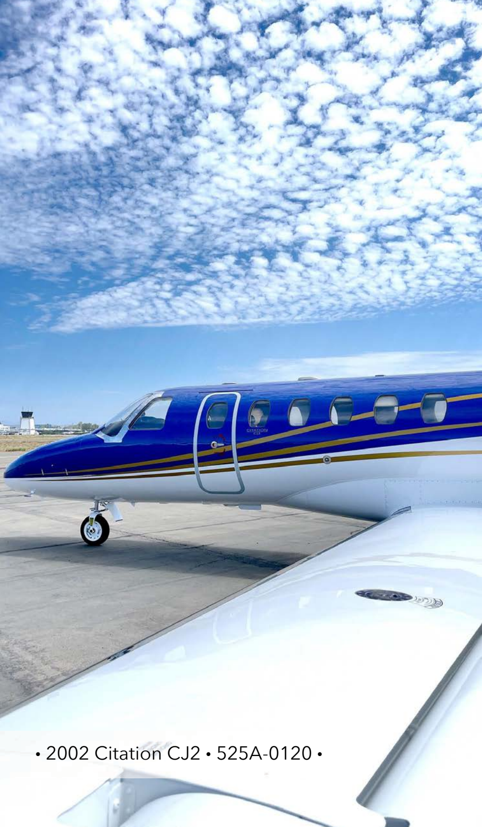
• 2002 Citation CJ2 • 525A-0120 •