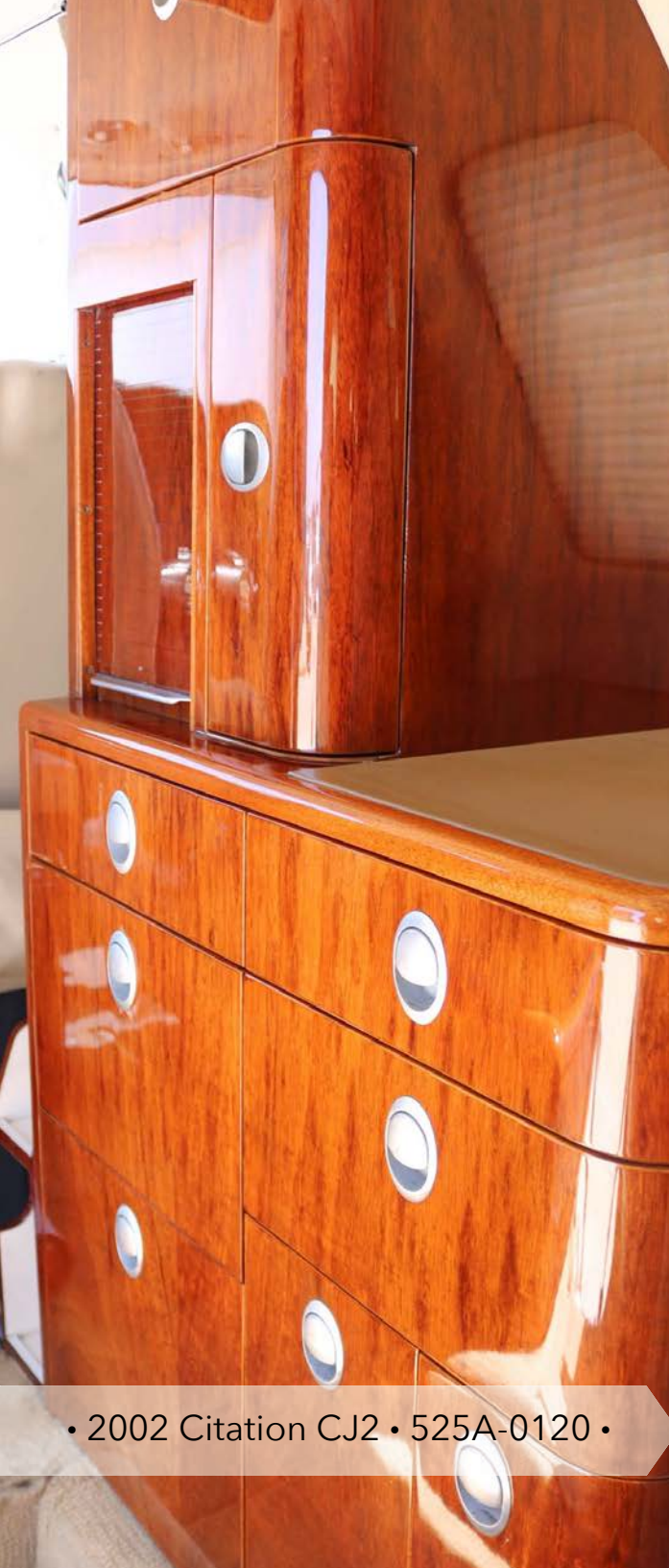
• 2002 Citation CJ2 • 525A-0120 •