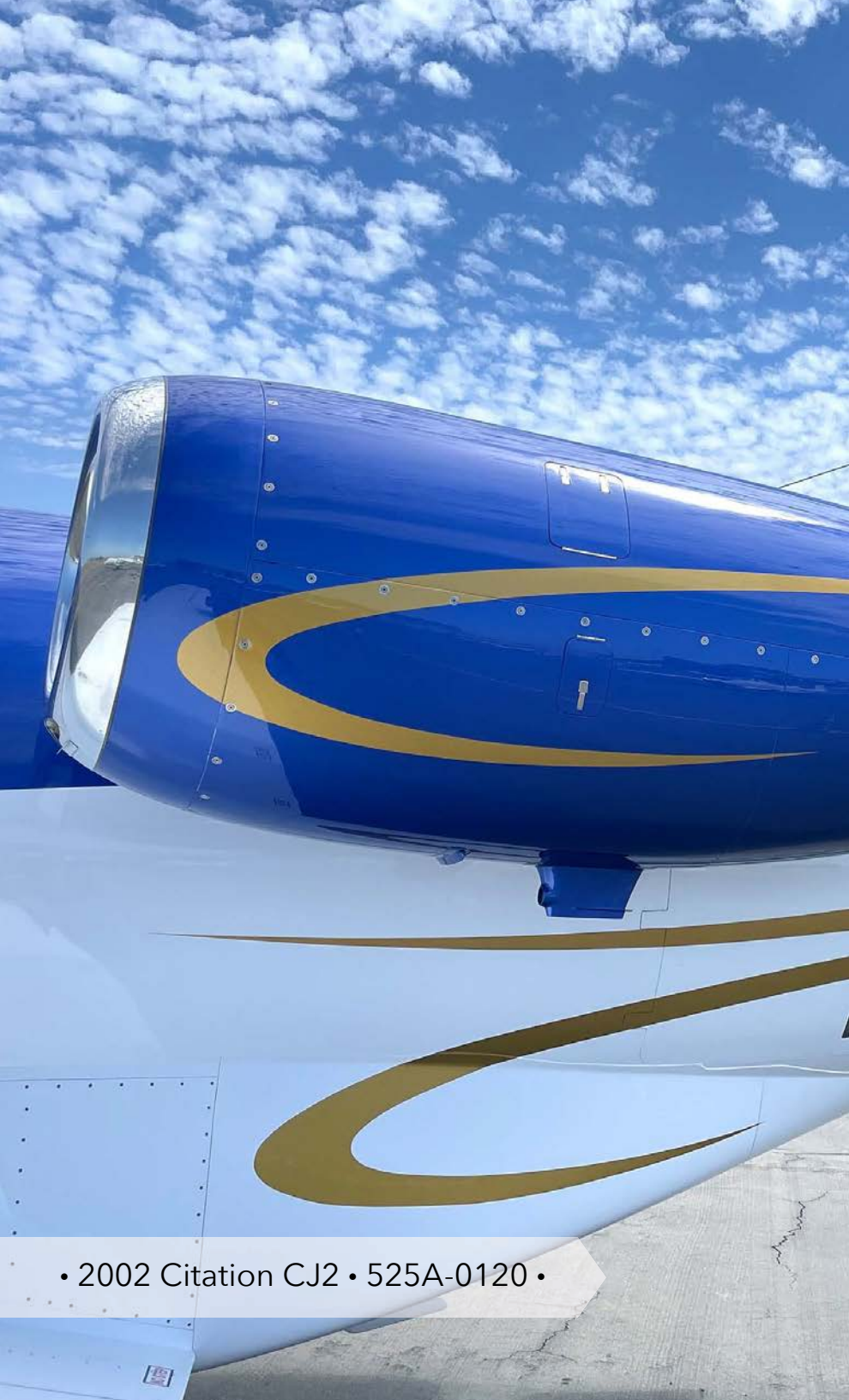
• 2002 Citation CJ2 • 525A-0120 •