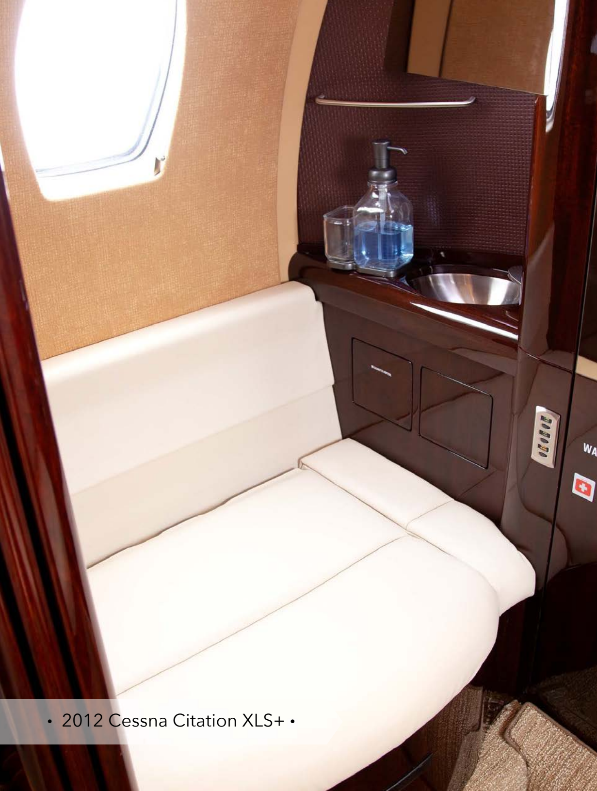
• 2012 Cessna Citation XLS+ •