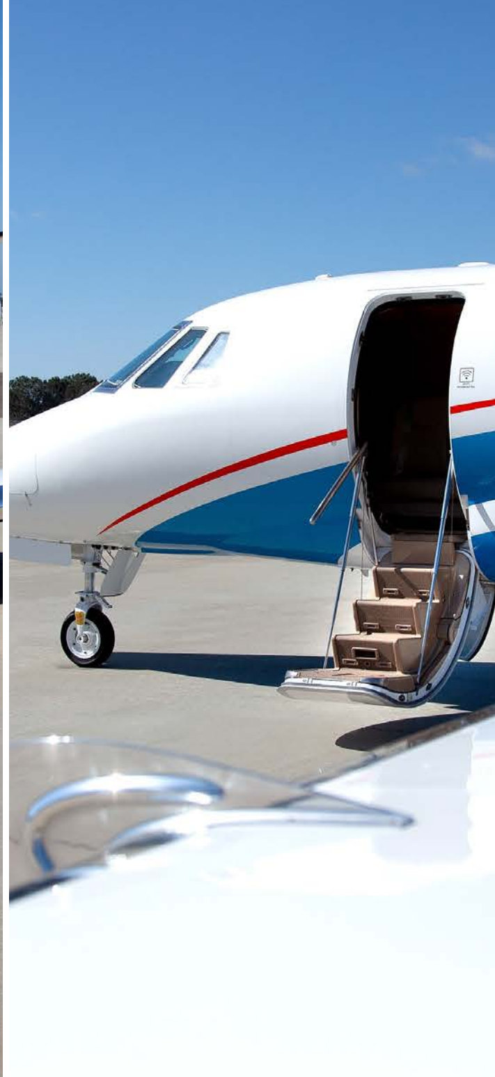
• 2012 Cessna Citation XLS+ •