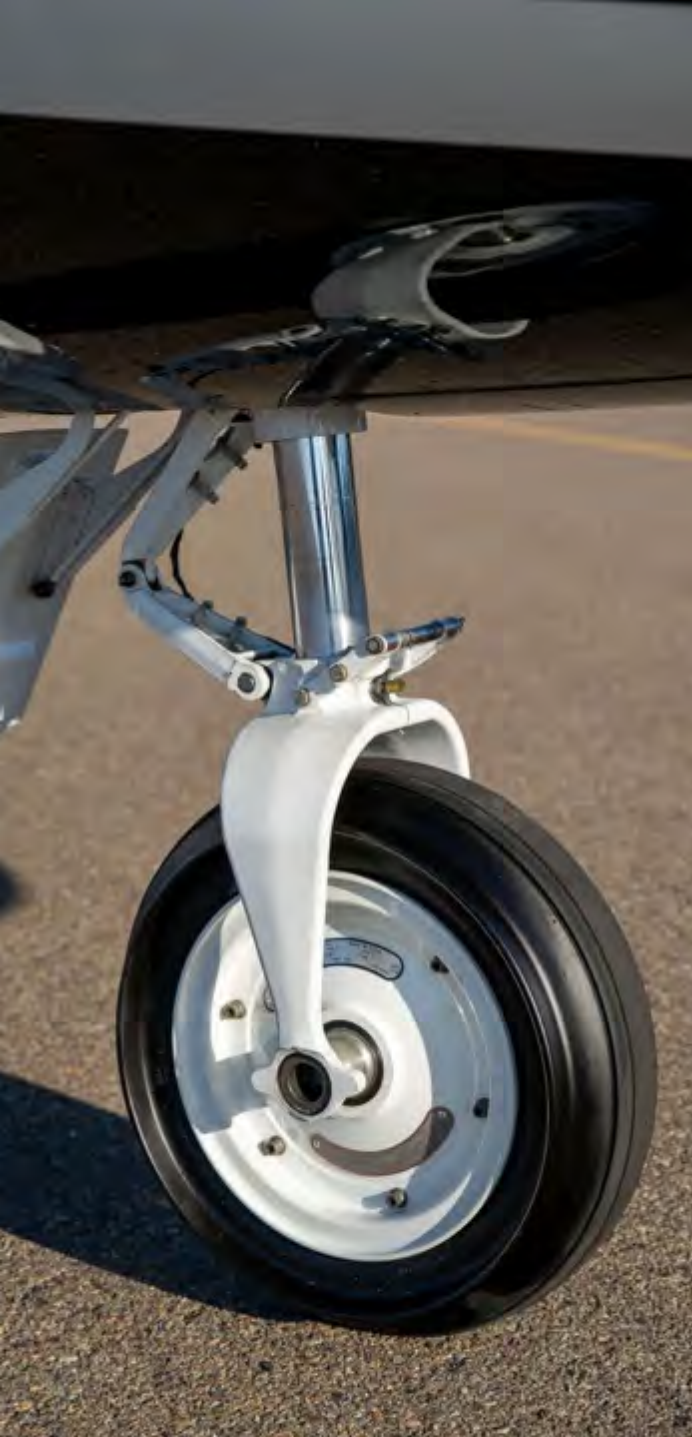
• 2006 Citation CJ3 • 525B-0111 •