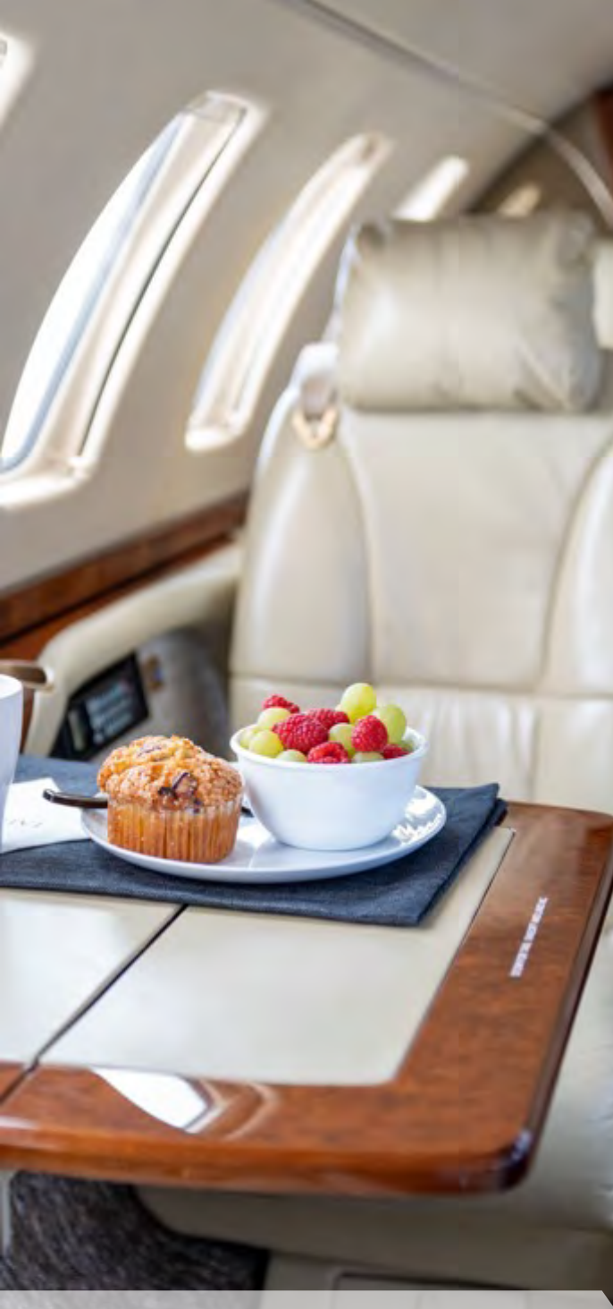
• 2006 Citation CJ3 • 525B-0111 •