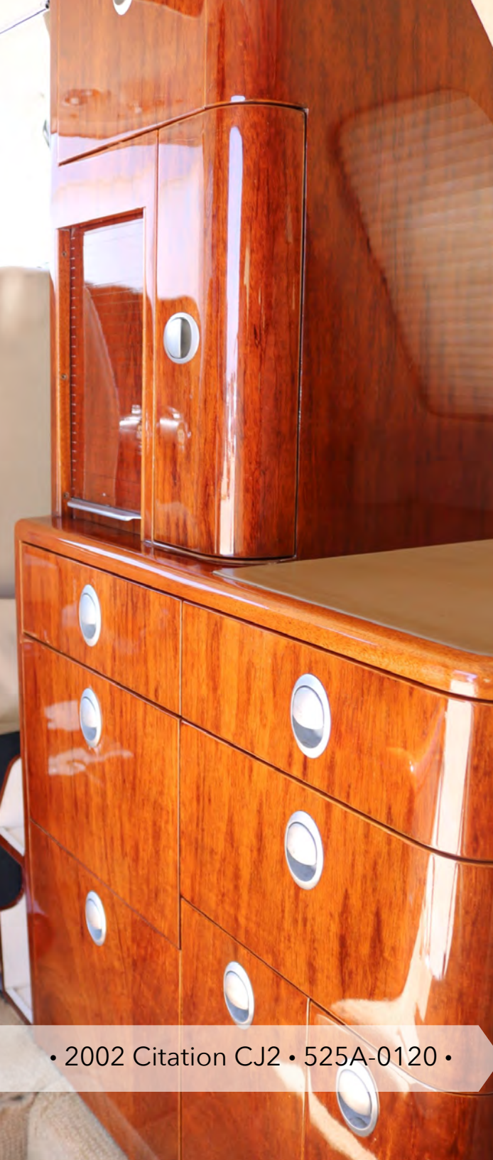
• 2002 Citation CJ2 • 525A-0120 •