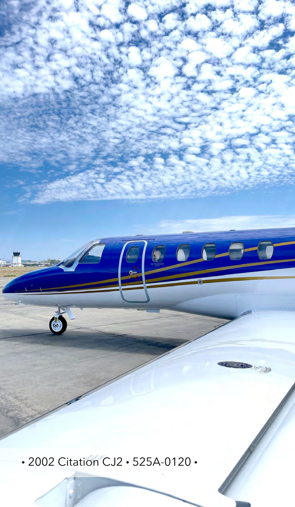
• 2002 Citation CJ2 • 525A-0120 •