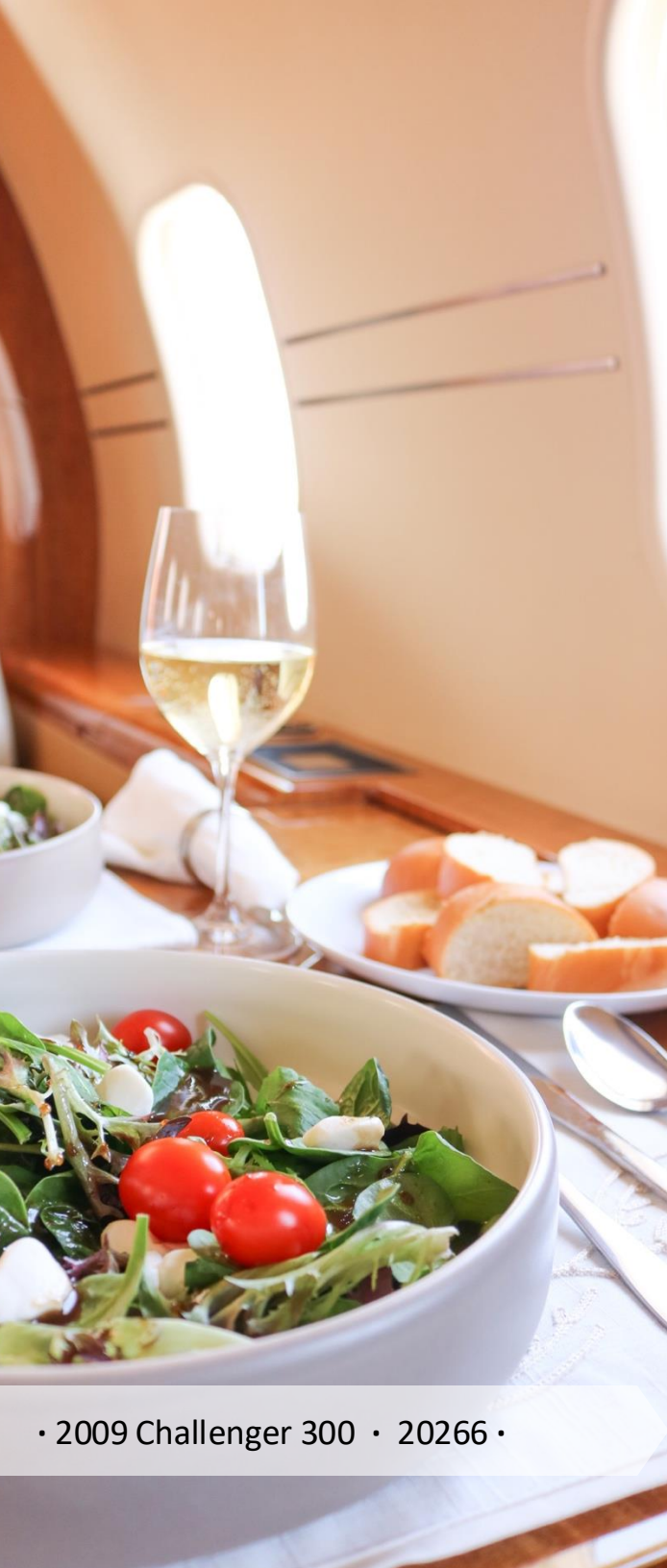
• 2009 Challenger 300 • 20266 •