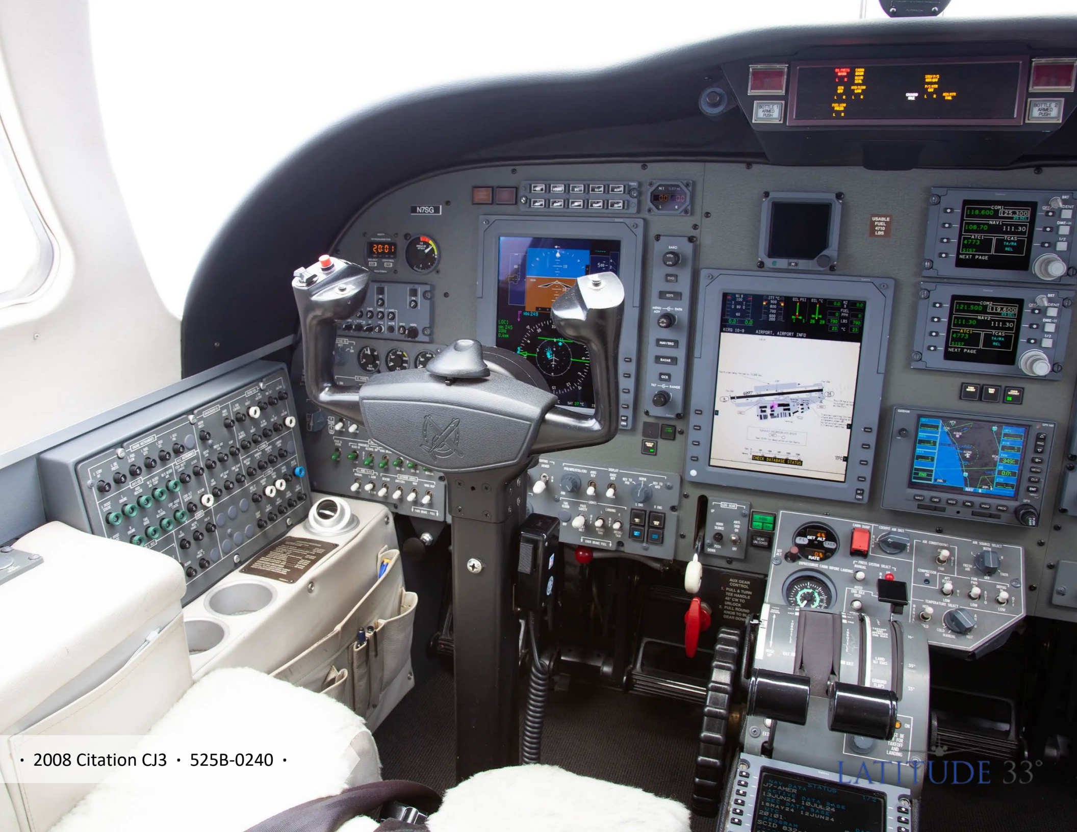
• 2008 Citation CJ3 • 525B-0240 •