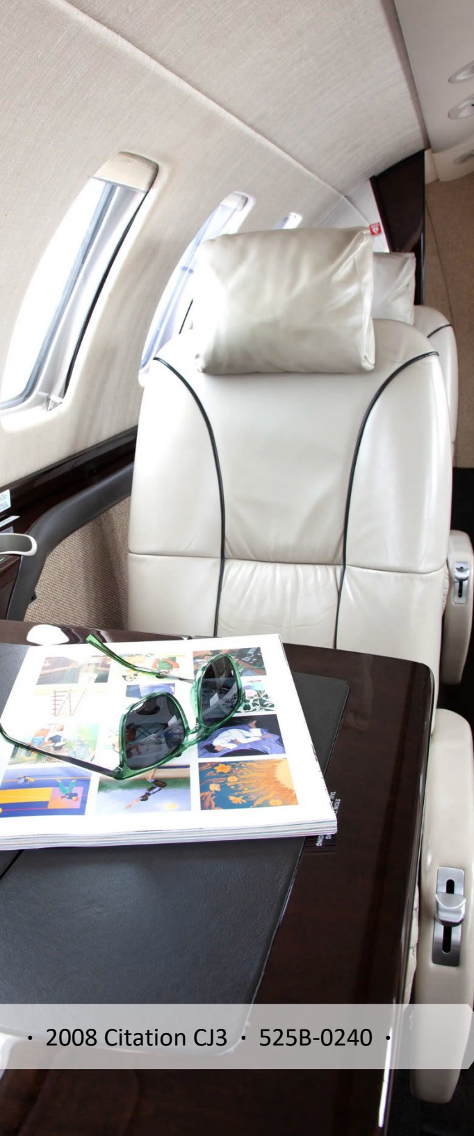
• 2008 Citation CJ3 • 525B-0240 •