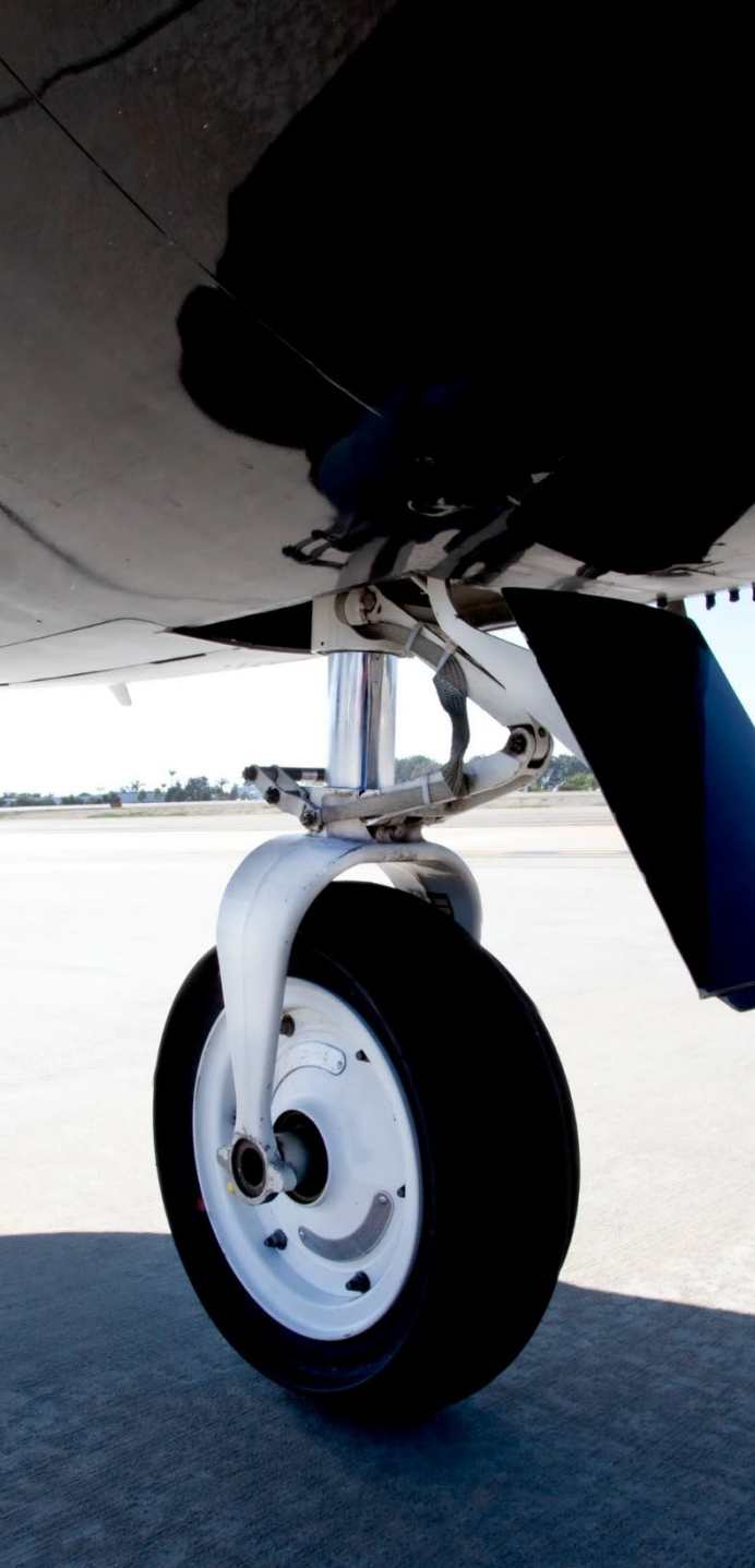
• 2008 Citation CJ3 • 525B-0240 •