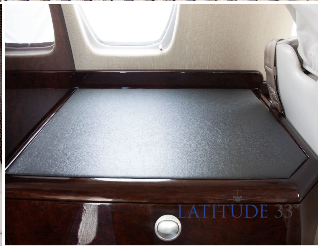
• 2008 Citation CJ3 • 525B-0240 •