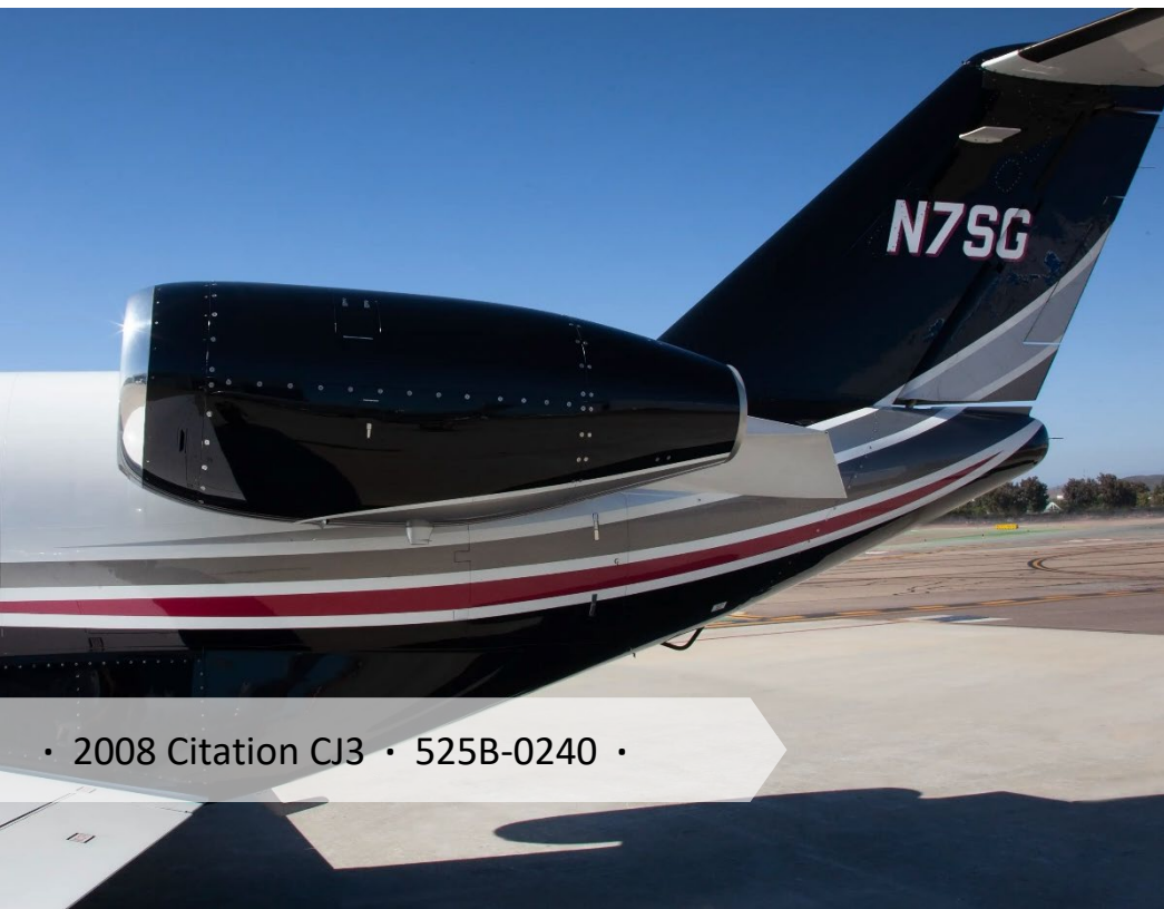
• 2008 Citation CJ3 • 525B-0240 •