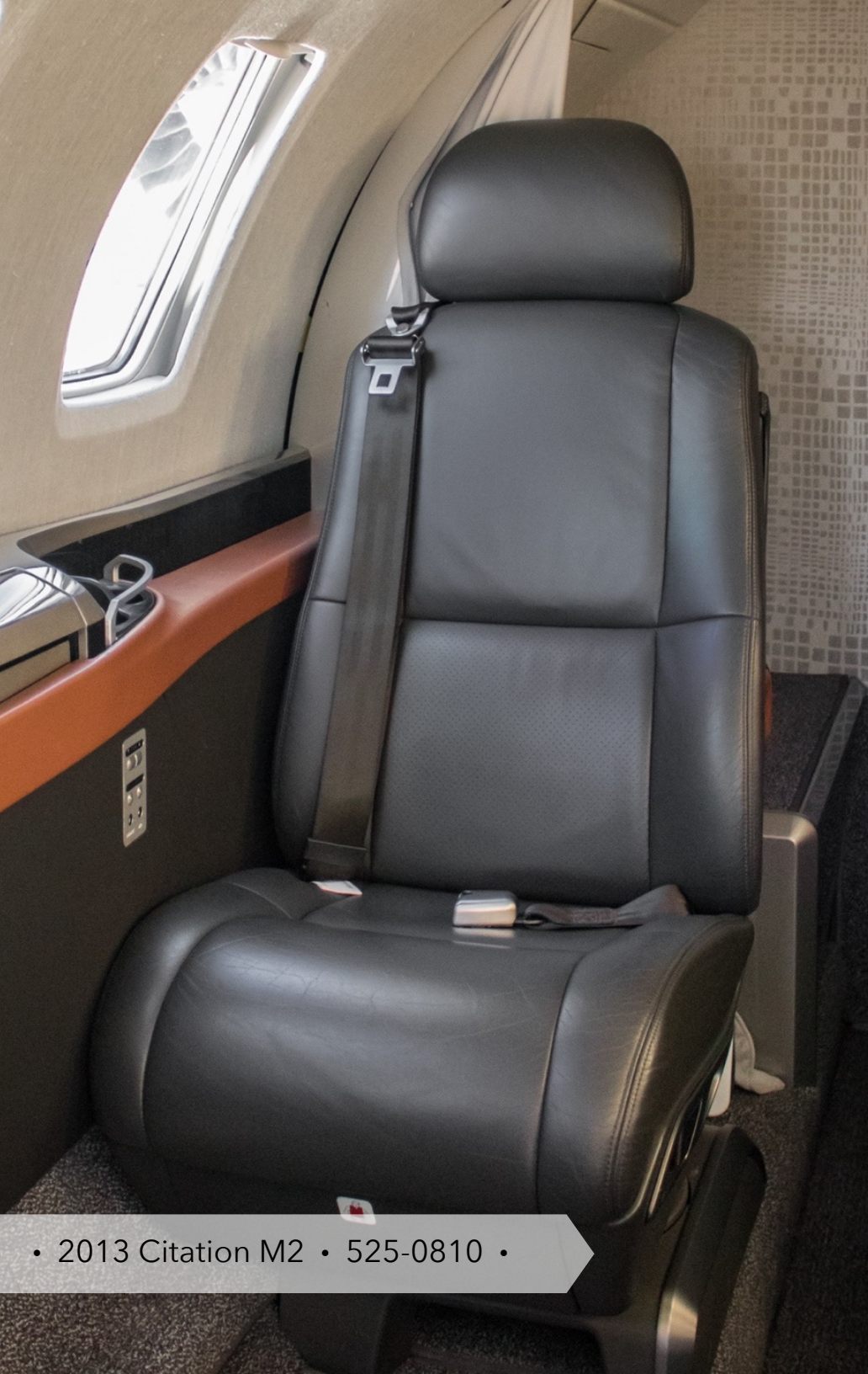
• 2013 Citation M2 • 525-0810 •