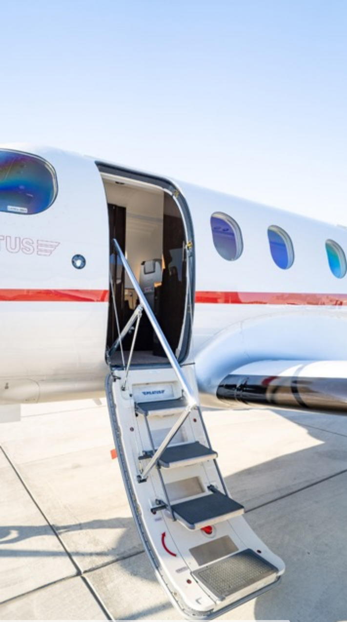
• 2018 Pilatus PC-12 NG • 1828 •