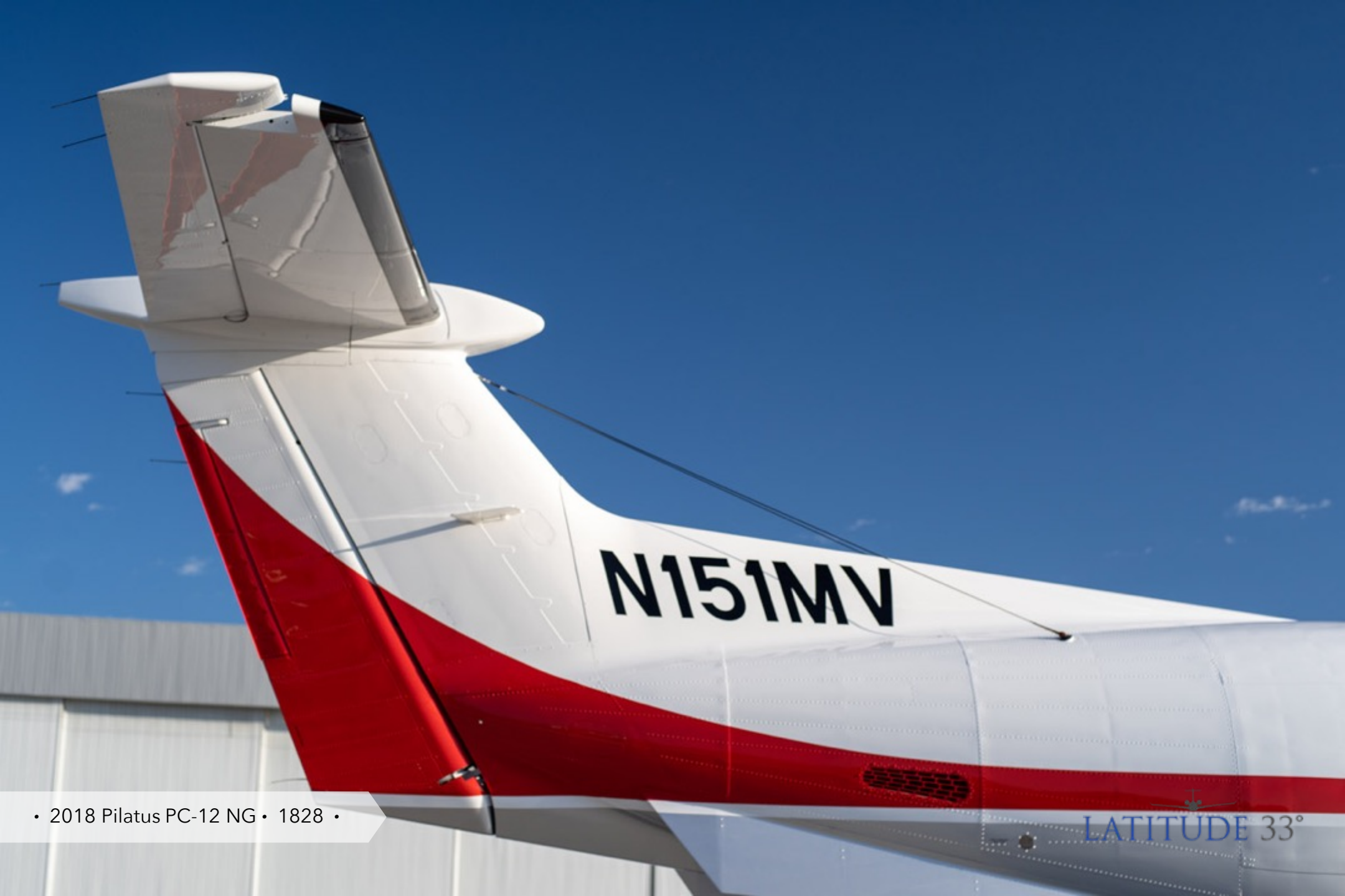
• 2018 Pilatus PC-12 NG • 1828 •