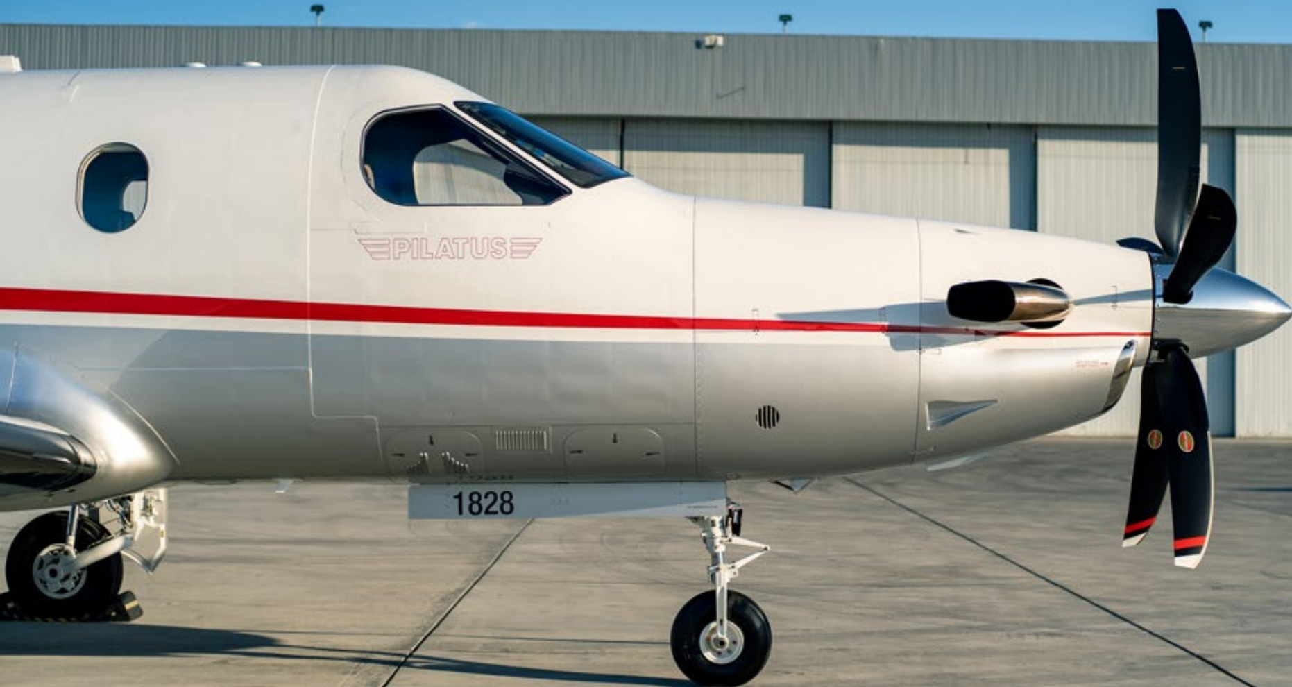
• 2018 Pilatus PC-12 NG • 1828 •