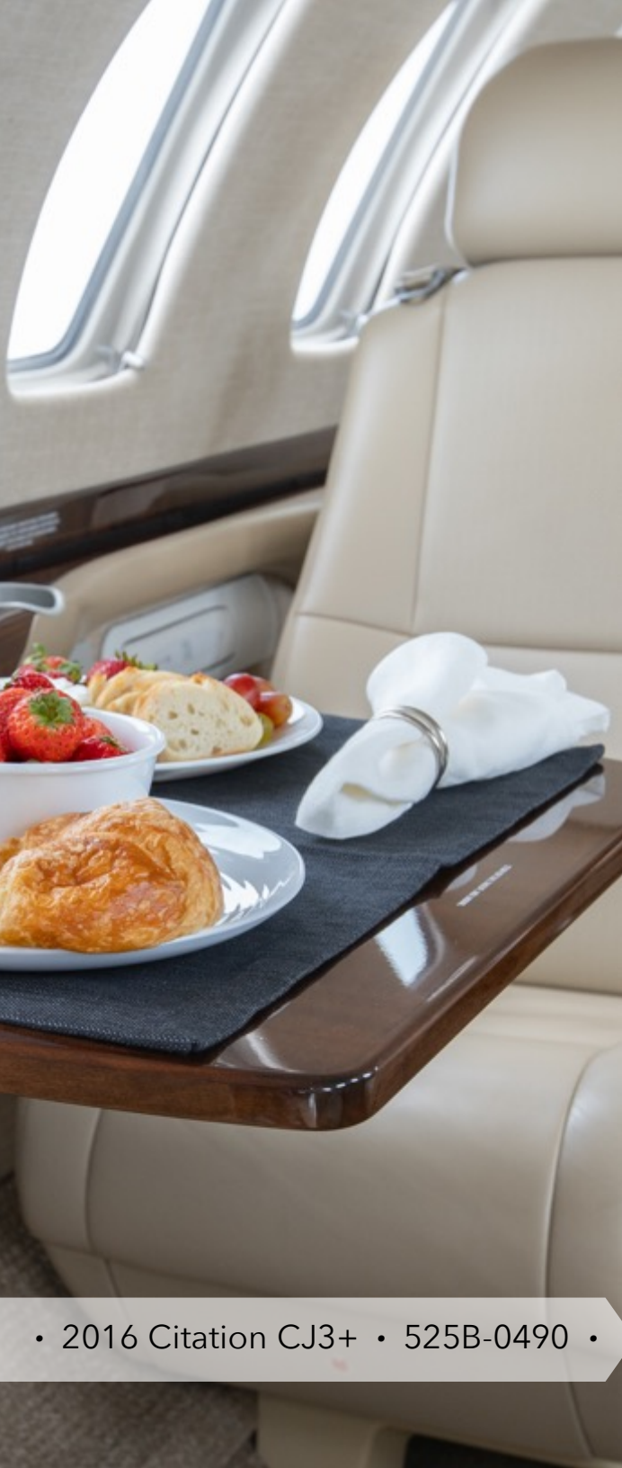
• 2016 Citation CJ3+ • 525B-0490 •