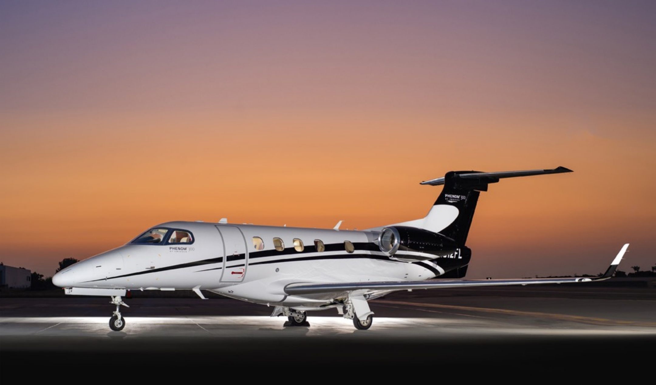
• 2011 Phenom 300 • 50500037 •