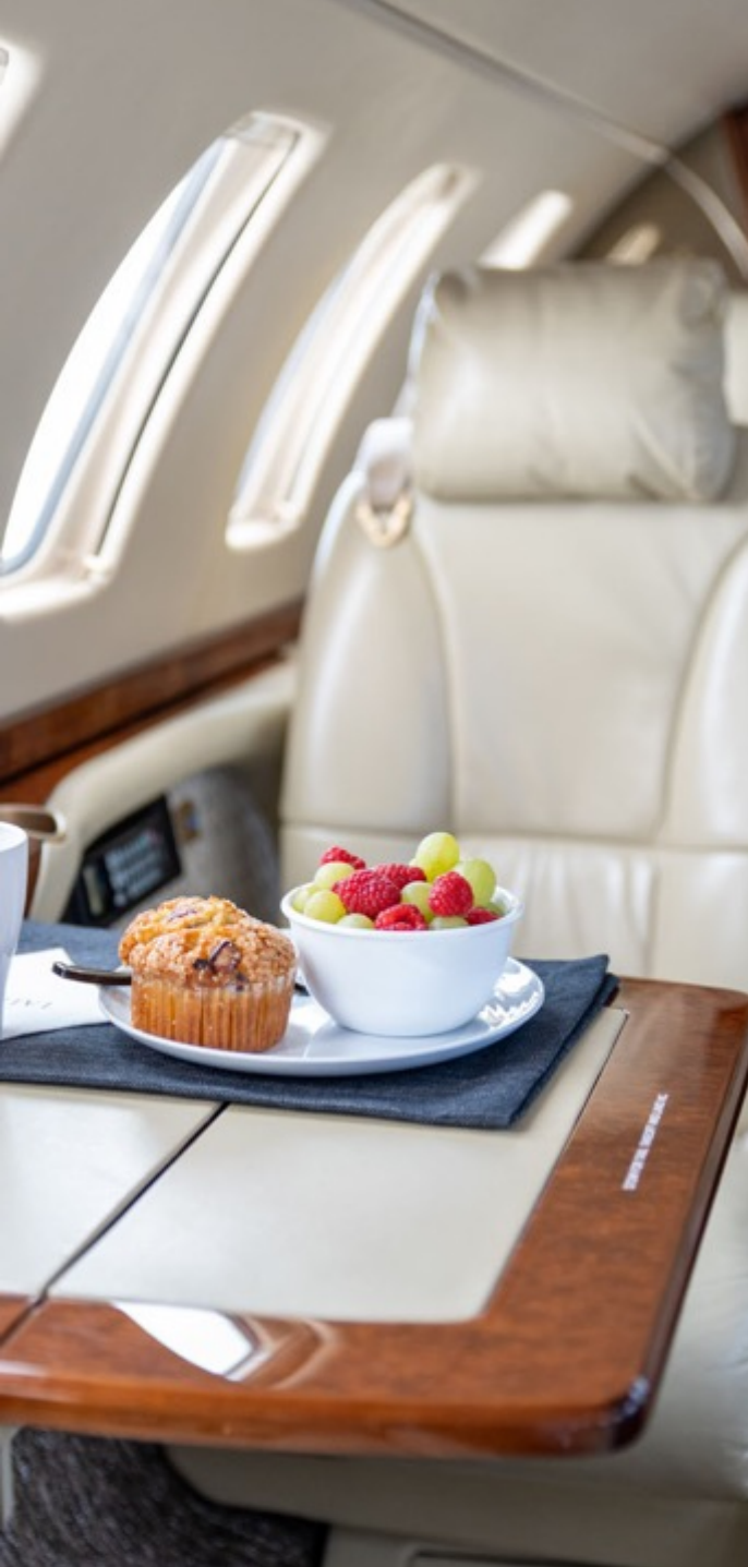
• 2006 Citation CJ3 • 525B-0111 •