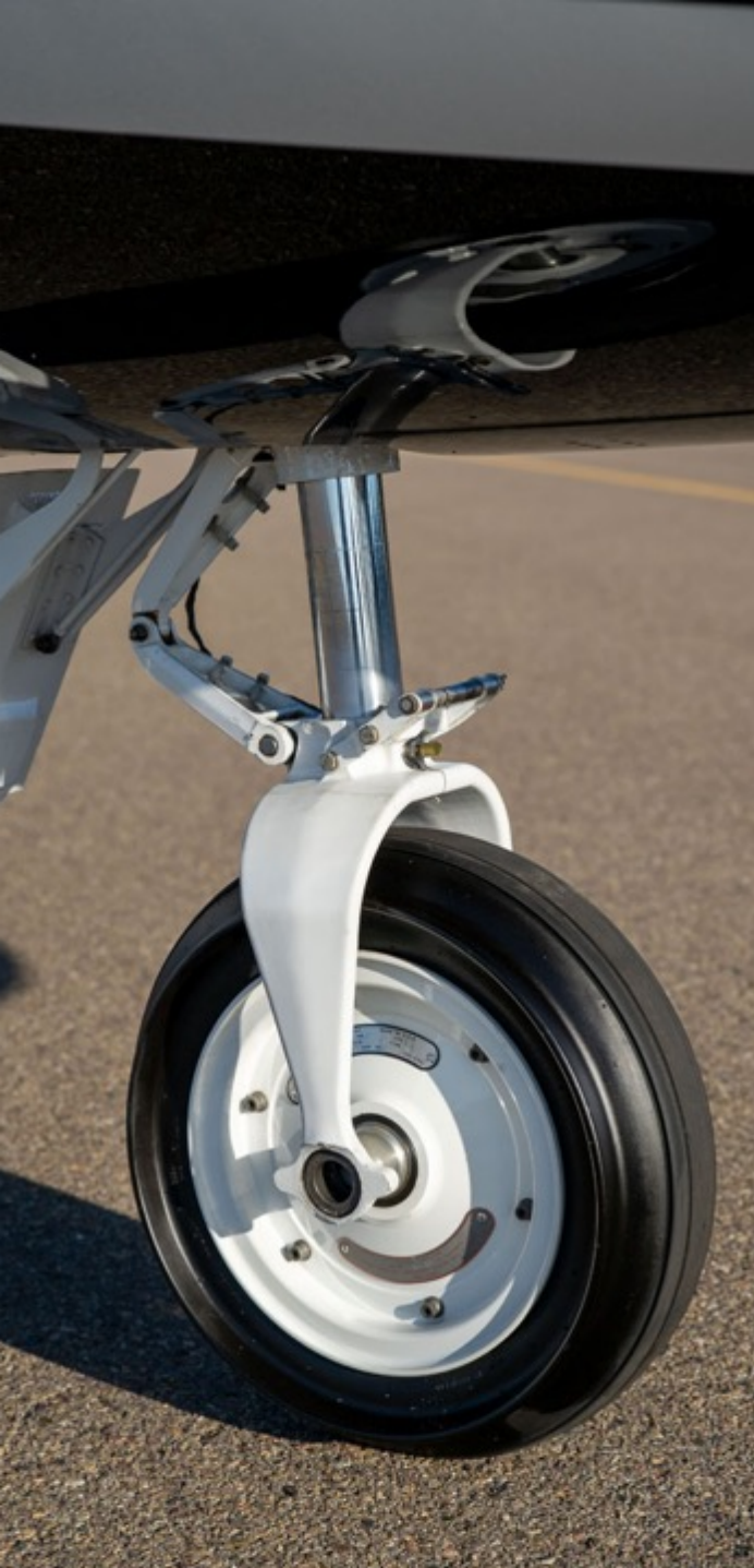
• 2006 Citation CJ3 • 525B-0111 •